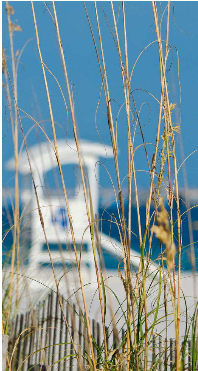
Gulf Shores, Alabama