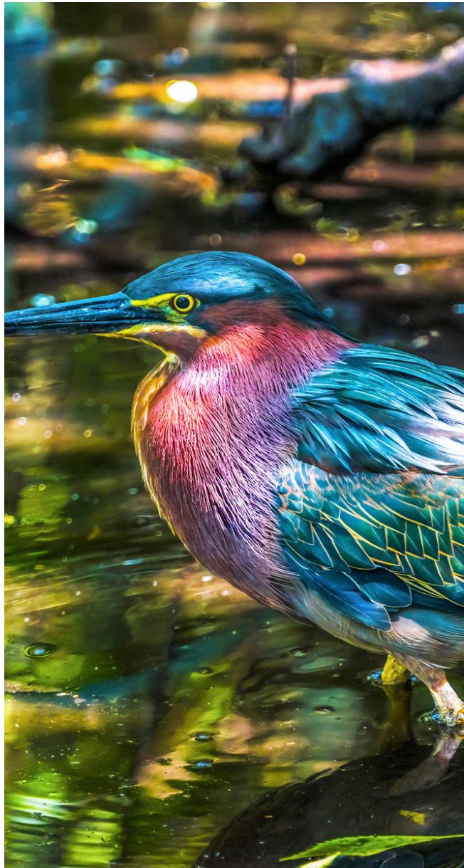
green heron in Florida