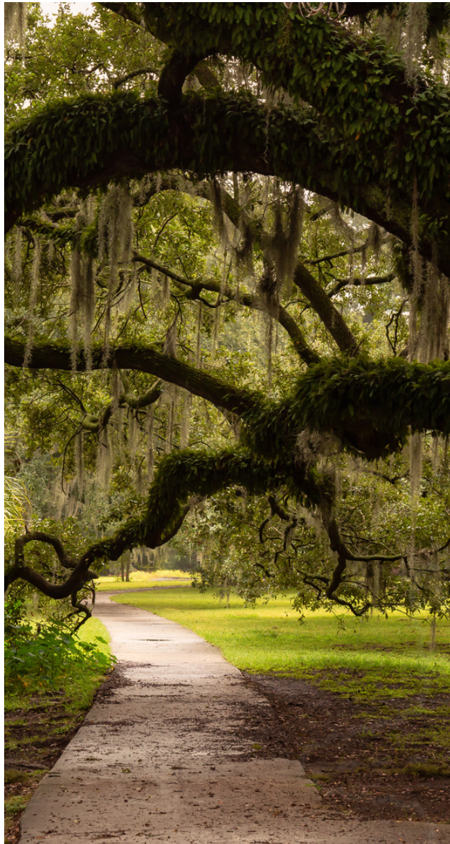
New Orleans, Louisiana