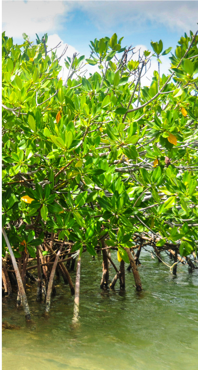
mangroves in Florida