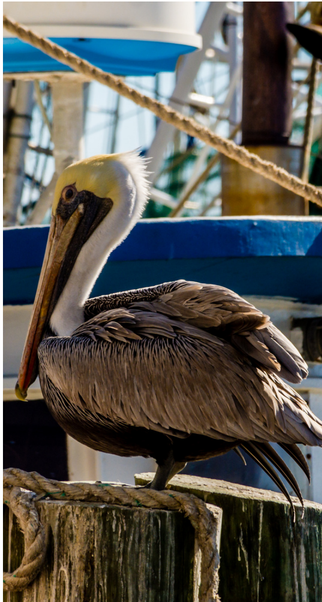
brown pelican in Mississippi