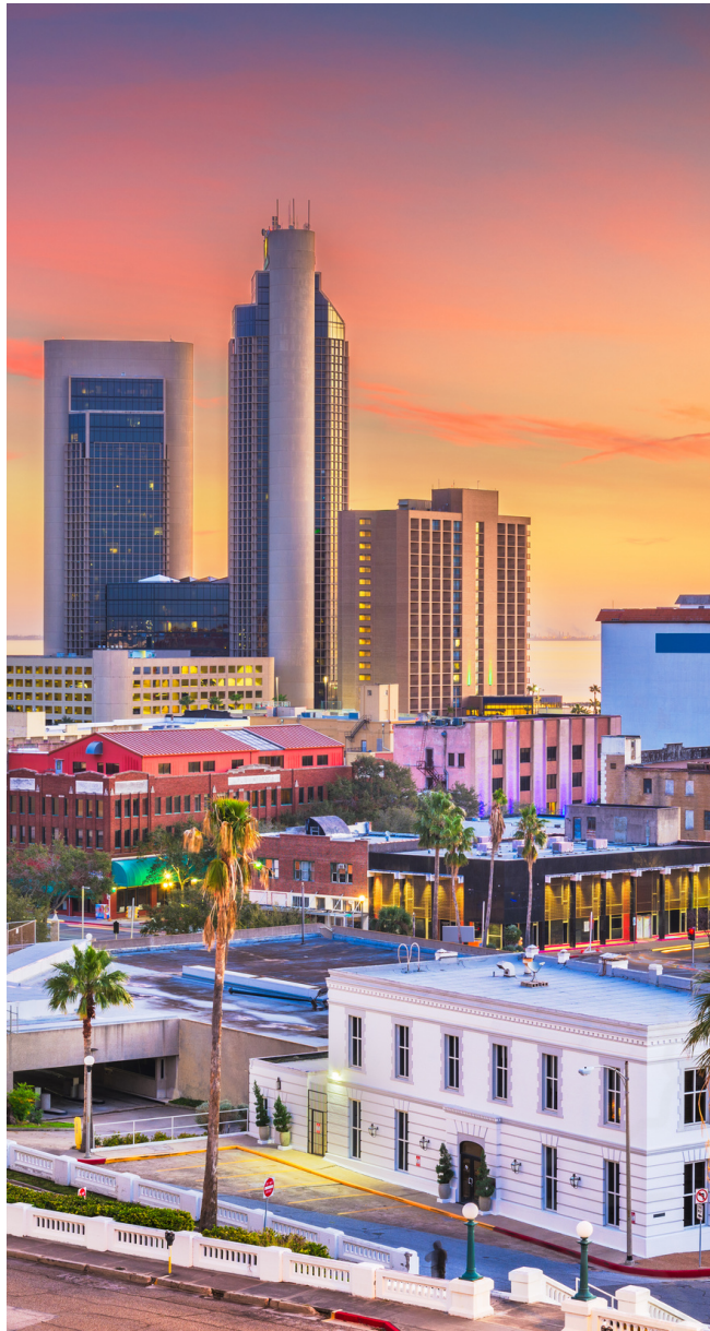
Corpus Christi, Texas